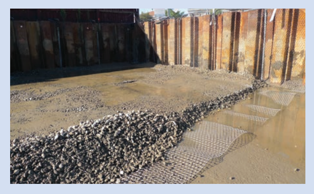
Reinforced Gravel Raft - geogrid and gravel installation

Many of the insights gained are also applicable and can be adapted to areas with commercial land and building developments.