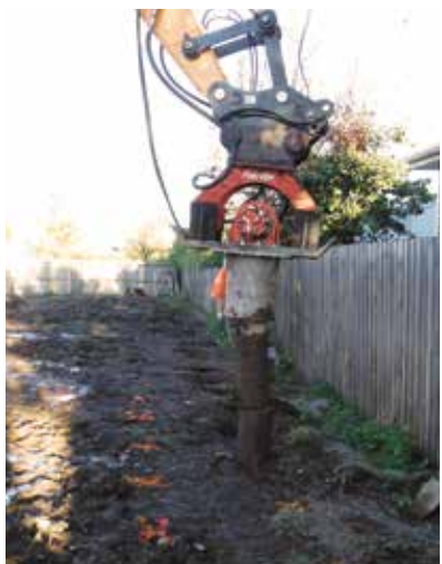
Above and below: Timber pole installation during the Ground Improvement Pilot Project, using a vibratory plate fixed to an excavator

Left: Driven timber pole installation during the Ground Improvement Pilot Project using a pile-driver mounted on an excavator