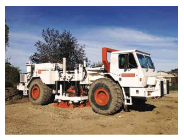
'T-Rex' - a shaker truck used for liquefaction shake testing

T-Rex shake testing does not adversely affect the ground being tested, so it can be repeated on the same area of constructed ground improvement for many different levels and durations of shaking. The truck uses a staged approach where it increases vibrations to induce liquefaction.