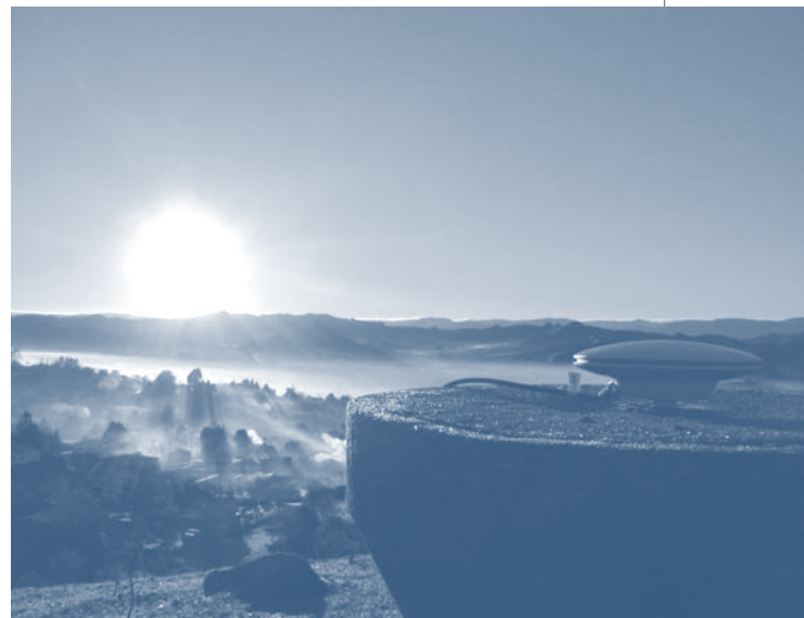
A GPS antenna on top of a survey mark in Taihape. The antenna is one component of the EQC-funded GeoNet equipment being used to monitor an ancient landslip on the western edge of the town. Movement of the slip has been slowed by the installation of drains and monitoring continues.