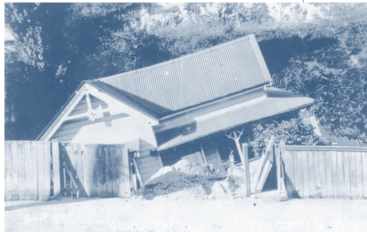
A house severely damaged by the 1931 Hawke's Bay earthquake. EQC is supporting the renewal of the 1931 earthquake exhibition at the Hawke's Bay Museum and Art Gallery.