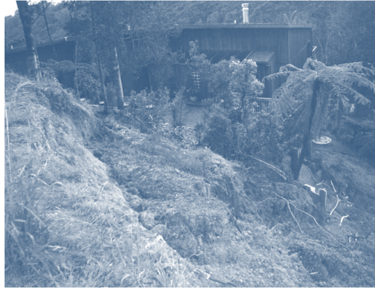
EQC received more than 600 claims from the Northland floods in March. EQC's cover provided funds for this massive slip in Opua (Bay of Islands) to be repaired.