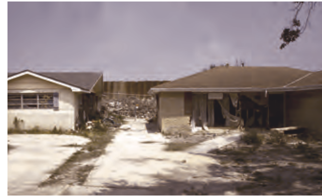
This photo shows two homes abandoned after flooding in New Orleans from Hurricane Katrina. Note in the background the steel outer wall of the canal system. These houses were two of many built below the level of the water in the canal.

It will take months and possibly years to process insurance claims let alone rebuild damaged and destroyed property and infrastructure. Adequate insurance is a critical factor. Individuals and organisations should do everything they can to be as prepared as possible.