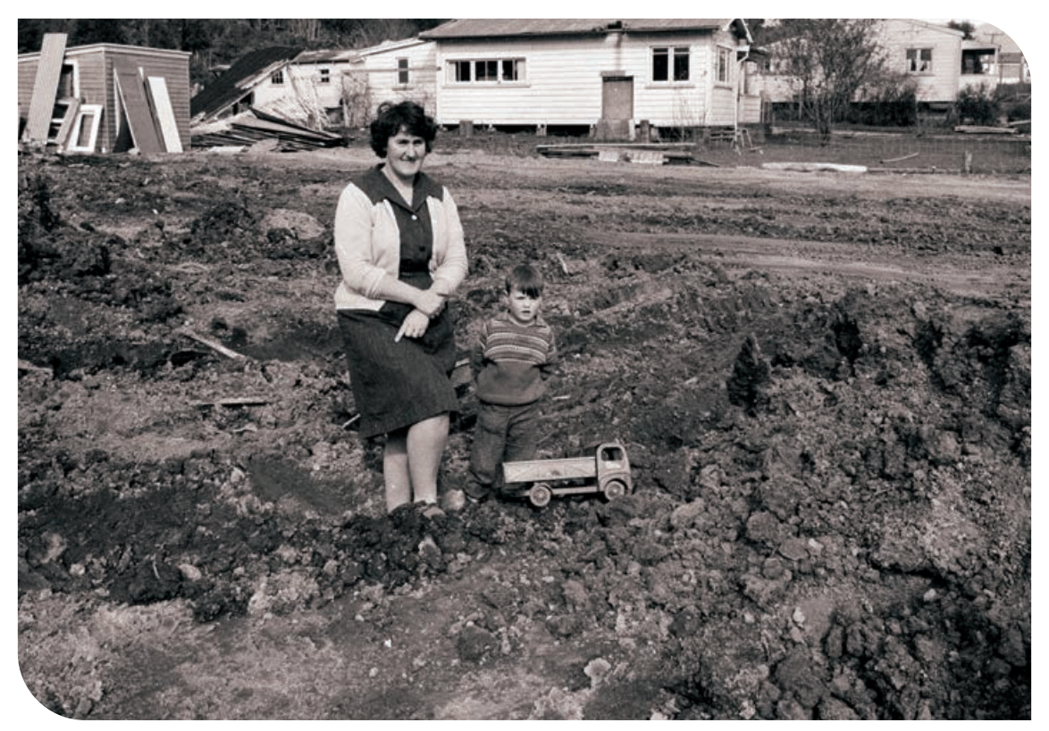
Inangahua earthquake 1968

This Statement of Intent should be read in conjunction with our annual Statement of Performance Expectations (SoPE). Performance against the measures in our SoPE is assessed and reported quarterly to the Treasury, as our monitoring agency, and yearly in our annual report. EQC publishes its SoPE, annual report, and monthly performance updates on the EQC website.