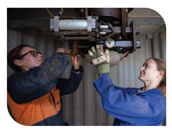
Volcanic ballistic testing, DEVORA research programme

The information EQC can provide international reinsurers helps inform their view of natural hazard perils in New Zealand and provides assurance that we are actively managing our risks. Financial support from reinsurance programmes means New Zealanders have access to affordable insurance for natural disasters.