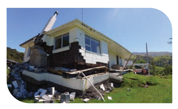
Kaikōura earthquake 2016

The findings of the Public Inquiry into EQC reinforced the importance of the role we play in the recovery process. Fair, transparent, fast and responsive insurance claims—and enduring settlements—enhance effective recovery processes.