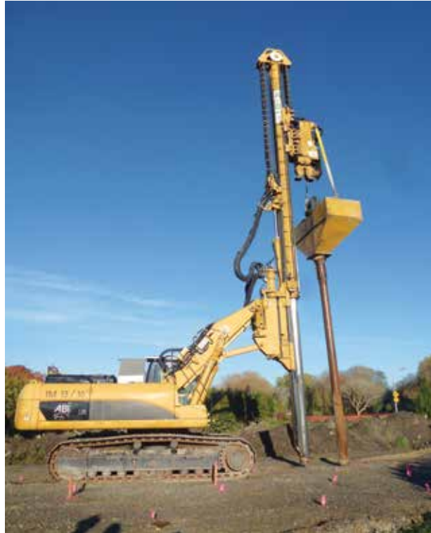
Equipment required to construct Rammed Aggregate Piers